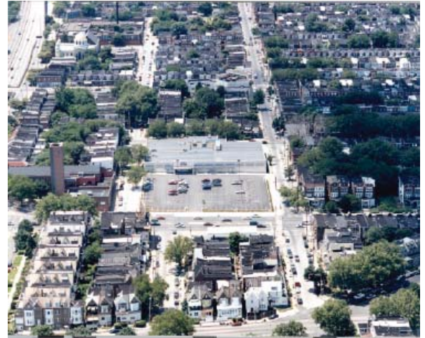
Urban Aerial View of Supremo

Designed to compliment the North Philadelphia community it serves, the new Thriftway store blends in well with the architecture of the neighborhood, and its selection of food items are compatible with the tastes of the diverse population of this section of the city. Ninety percent (90%) of the employment positions filled at Brown's Thriftway were given to people who lived within a 3 block radius of the store, providing an economic boost to the community.