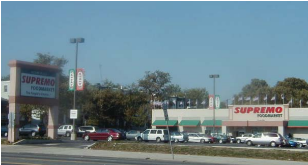
Exterior of Supremo Food Market

Designed to compliment the North Philadelphia community it serves, the new Thriftway store blends in well with the architecture of the neighborhood, and its selection of food items are compatible with the tastes of the diverse population of this section of the city. Ninety percent (90%) of the employment positions filled at Brown's Thriftway were given to people who lived within a 3 block radius of the store, providing an economic boost to the community.